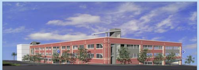
A rendering of Lincoln Street Parking Garage

A panel from our recruiting station describing the benefits available to employees of Dennis Corporation.