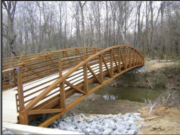
Possible Bridge Replacement