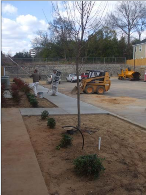
The Plants are Planted Outside of the New Corporate Headquarters on March 4, 2010