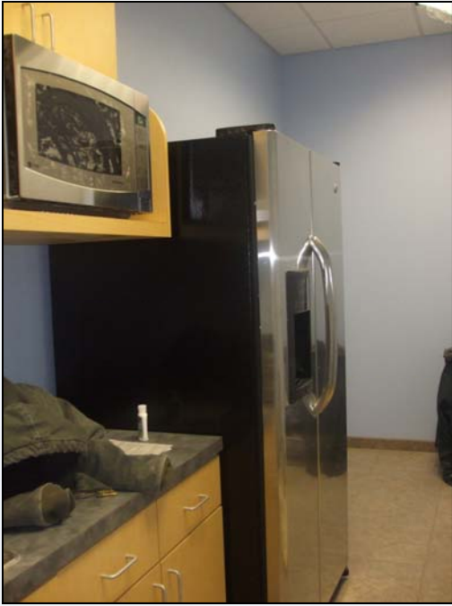
Installation of the Refrigerator and Microwave in the Break Room is Completed March 3, 2010