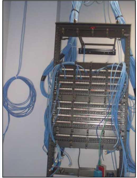
The IT Network Begins is Set Up in the Server Room March 3, 2010