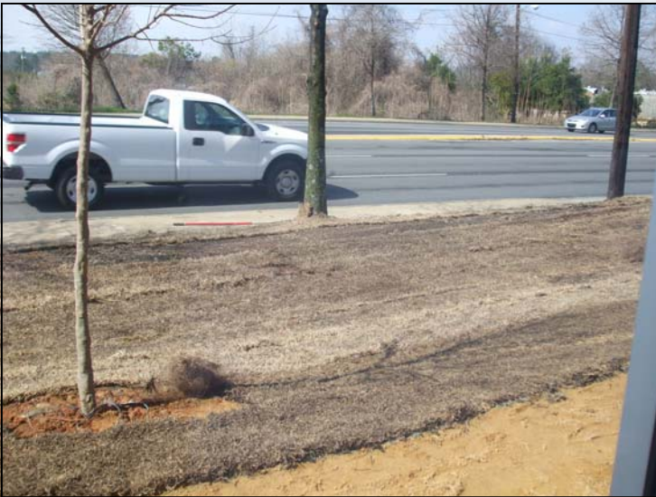
Grass is Put Down Outside of the New Building March 3, 2010

Dennis Corporation is a South Carolina licensed civil engineering, surveying and construction management firm. Dennis Corporation's specific fields of expertise include aviation engineering, civil infrastructure, construction management, construction services, environmental services, expert witness, intelligent transportation systems, program management, special projects, surveying, traffic engineering, transportation engineering and water resources.