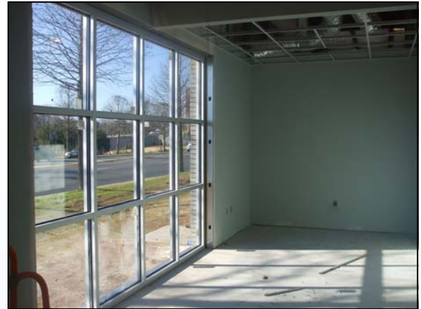
A View of Huger Street from an Office February 3, 2010