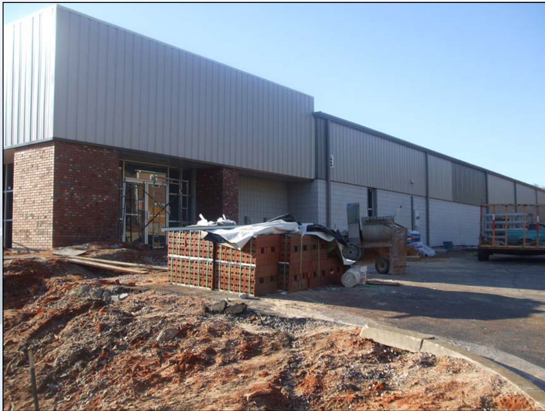
Outside View February 3, 2010