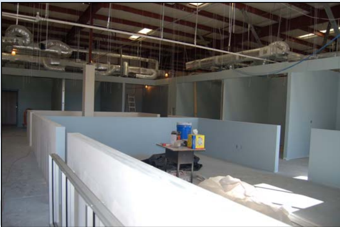
Construction on the Back Offices February 1, 2010

Dennis Corporation is a South Carolina licensed civil engineering, surveying and construction management firm. Dennis Corporation's specific fields of expertise include aviation engineering, civil infrastructure, construction management, construction services, environmental services, expert witness, intelligent transportation systems, program management, special projects, surveying, traffic engineering, transportation engineering and water resources.