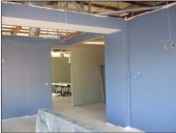
The Entryway February 3, 2010