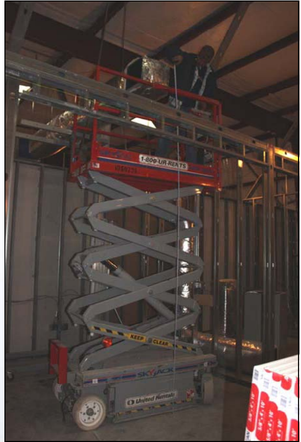
Installation of Ductwork