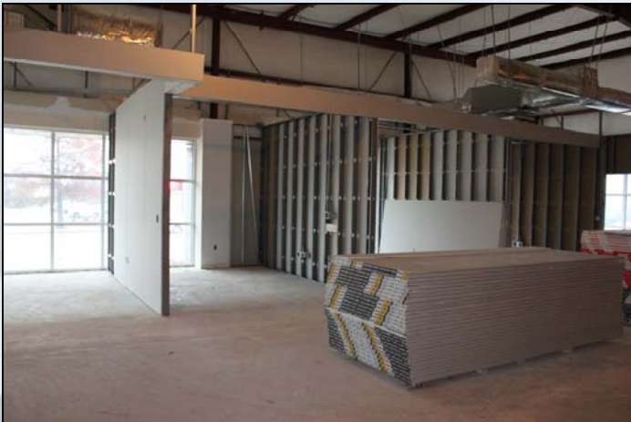
Drywall is Added to Frames December 18, 2009