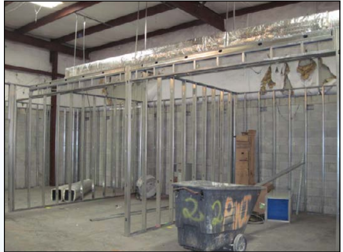
Frames for Walls Go Up December 14, 2009

Dennis Corporation is a South Carolina licensed civil engineering, surveying and construction management firm. Dennis Corporation's specific fields of expertise include aviation engineering, civil infrastructure, construction management, construction services, environmental services, expert witness, intelligent transportation systems, program management, special projects, surveying, traffic engineering, transportation engineering and water resources.