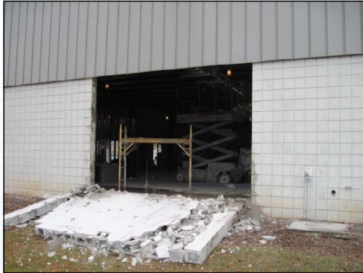
A Wall is Demolished to Create a New Window December 14, 2009