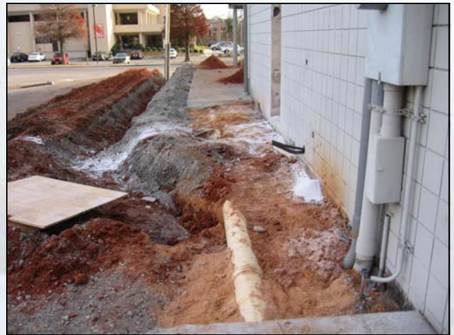
Construction on the Outside of the Building December 16, 2009