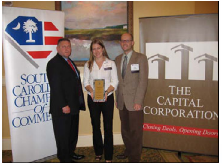
Dennis Corporation Representatives at the Awards Ceremony

Dennis Corporation is a South Carolina licensed civil engineering, surveying and construction management firm headquartered in Columbia, SC, with field offices in Bluffton, Chester, Mt. Pleasant, Ridgeland, and Winnsboro. Dennis Corporation's specific fields of expertise include aviation engineering, civil infrastructure, construction management, construction services, environmental services, expert witness, intelligent transportation systems, program management, special projects, surveying, traffic engineering, transportation engineering and water resources.