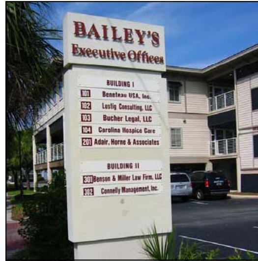
Dennis Corporation's new Charleston Office

Dennis Corporation is a South Carolina licensed civil engineering, surveying and construction management firm. Dennis Corporation's specific