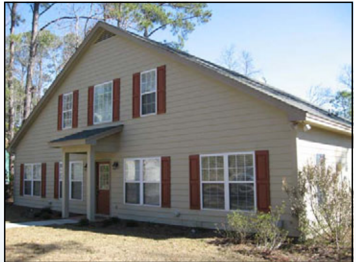
Dennis Corporation's new Ridgeland Field Office

Dennis Corporation is a South Carolina licensed civil engineering, surveying and construction management firm. Dennis Corporation's specific fields of expertise include aviation engineering, civil infrastructure, construction management, construction services, environmental services, expert witness, intelligent transportation systems, program management, special projects, surveying, traffic engineering, transportation engineering and water resource management.