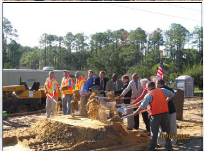
Local officials and Dennis Corporation representatives take the first steps of construction at the groundbreaking of the new SC 802 Bridge and Roadway Widening Project in Beaufort County, SC.