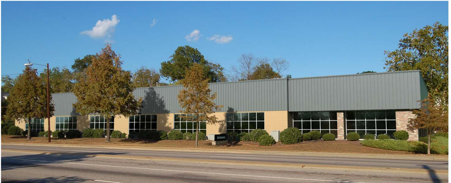
Rendering: View from Huger Street