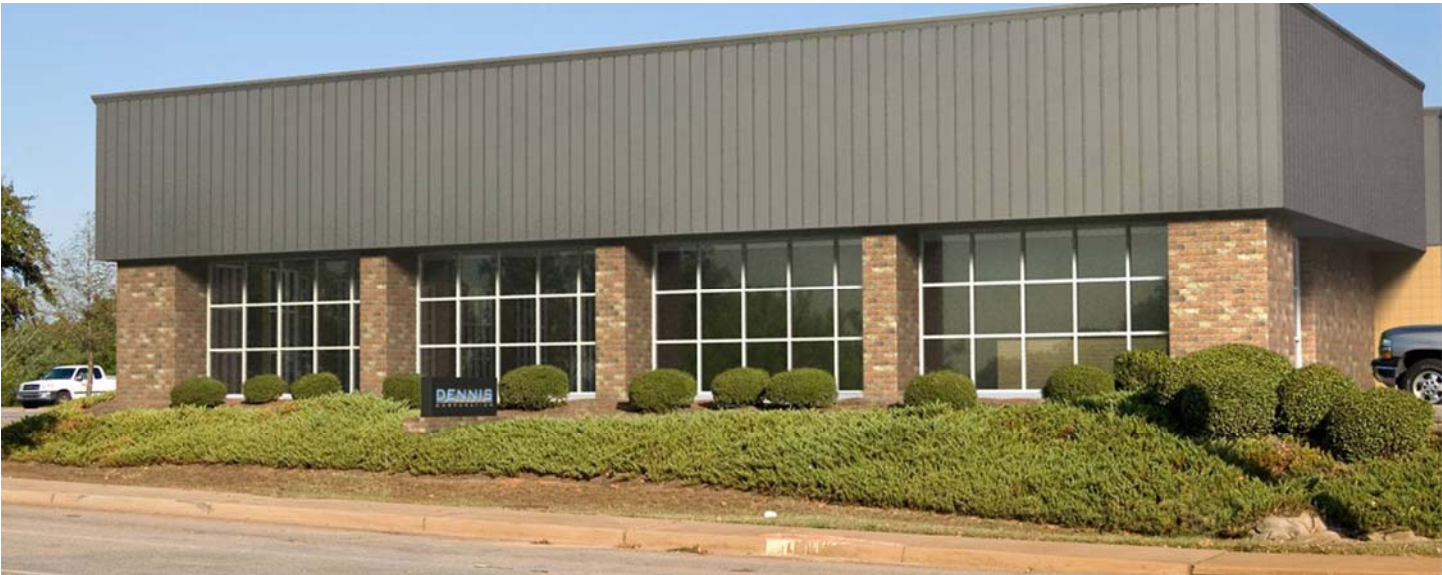
Rendering: View from Laurel Street