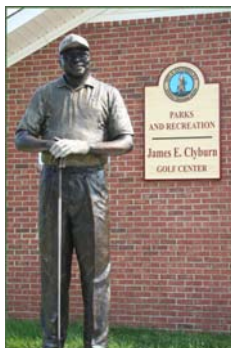
James Clyburn Statue & Dedication Plaque

Dennis Corporation is proud to be a sponsor of this facility which will provide a safe learning environment for today's youth to develop and learn values that will enhance their lives now and into the future.